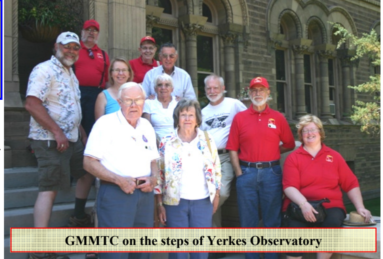
GMMTC on the steps of Yerkes Observatory